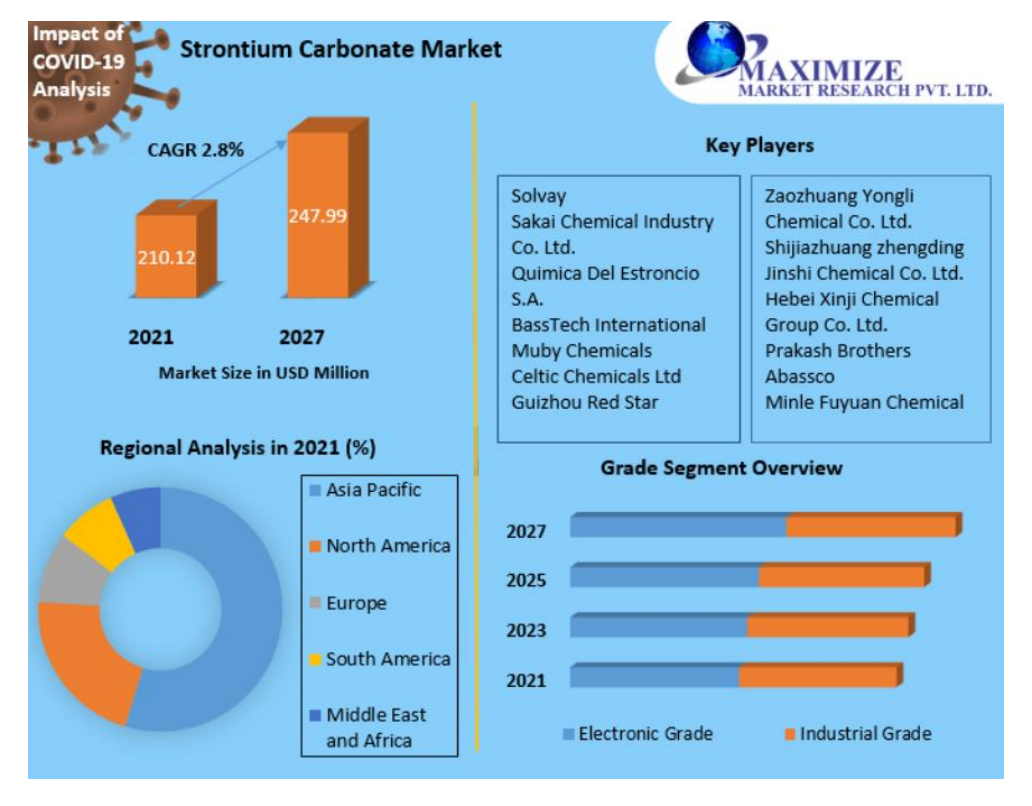
Figure 2: Key region-payers of the Strontium Carbonate Market.

The Strontium Carbonate Market size was valued at US$ 210.12 Mn. in 2021, and the total revenue is expected to grow at a CAGR of 2.8% from 2027. According to <u>MMR</u>, the major industry players and regions in depth are North America, Asia Pacific, Europe, Middle East & Africa, and South America (Fig 2).