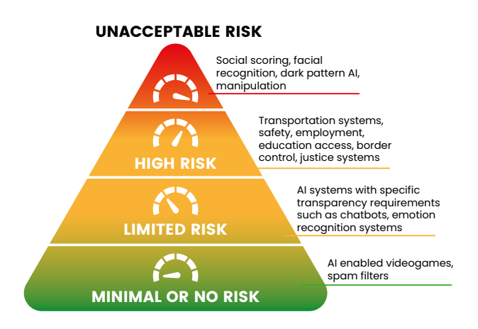
Figure 1 - Risk Assessment Hierarchy

The AI Act establishes a risk-based classification, dividing the use of AI into the categories of "unacceptable, high, and limited or minimal risks," as per the graphic in Figure 1.