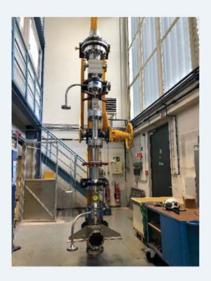
Figure 1: First trial setup of the COSMOS-H test track in McSAFER

The experimental test facility COSMOS-H ("Critical Heat Flux on Smooth and Modified Surfaces – High Pressure Loop") is developed and set up for the detailed investigation of thermohydraulic phenomena like boiling and complex flow phenomena that can occur in (nuclear) power plants.