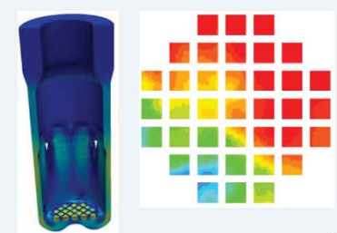
Figure 2 NuScale Mixing Scalar Test Fluent calculation (ÚJV)

Work Package 5 – Multi-scale plant analysis methodologies for SMR applied postulated accident scenarios