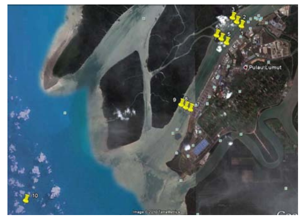
Fig. 1 Location of the sampling stations in West Port Malaysia

West Port is one of the Malaysia's principal gateway and busiest port with 22 berths. West port has been developed along the Klang strait and it is well sheltered by surrounding mangrove Islands. In this project, study area is restricted to narrow corridor between Klang Island and Che Mat Zin Island on the west of the Indah Island, 10 points are defined in this project "Fig. 1". The study area lies within humid tropical part with rainy season (North monsoon, November to March) and dry season [4]