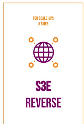
Figure 1. S3E Tracks