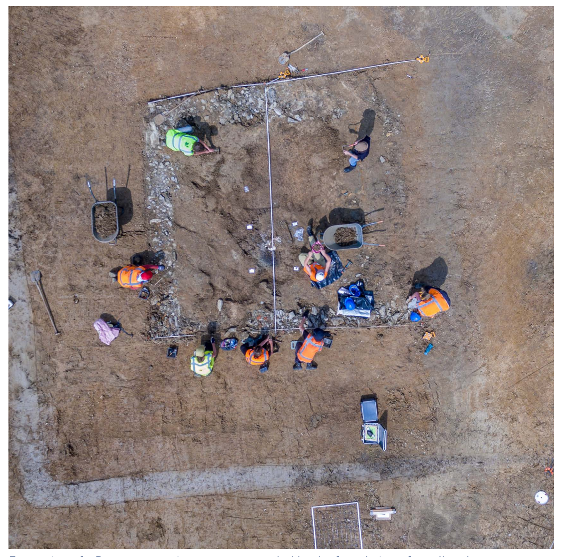
Excavation of a Roman cremation grave surrounded by the foundation of a wall and a L-shaped ditch in the 'Beuningse plas' sand extraction area, Beuningen (The Netherlands)

These criteria will enable its users to evaluate how successful the research framework has been in delivering its original aims and objectives and will help shape its future development.