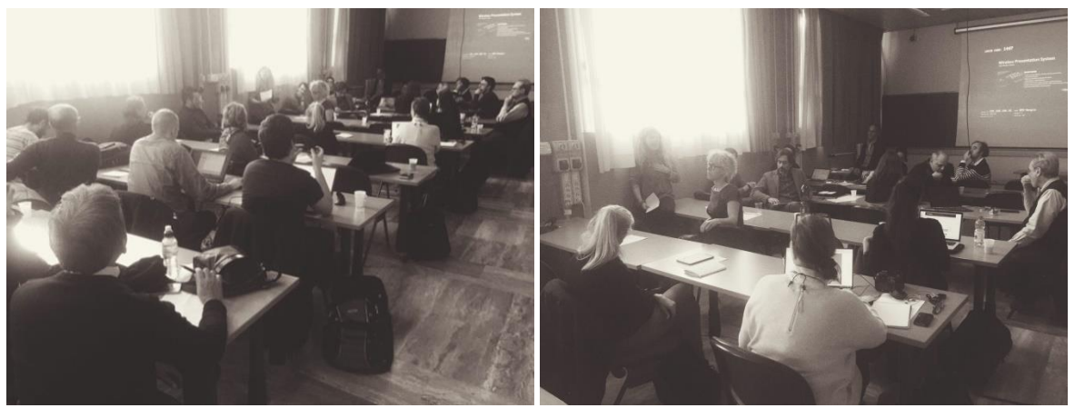
Panel Discussion during the Users' Board Session in Milan

The feedback received by the experts was encouraging. Most participants appeared enthusiastic about the overall content of the project, impressed by the technical developments made so far, and curious about the expected outcomes, and they provided specific suggestions on how to improve WhoLoDancE content wise. The list of participants in the users' board is presented in the following table.