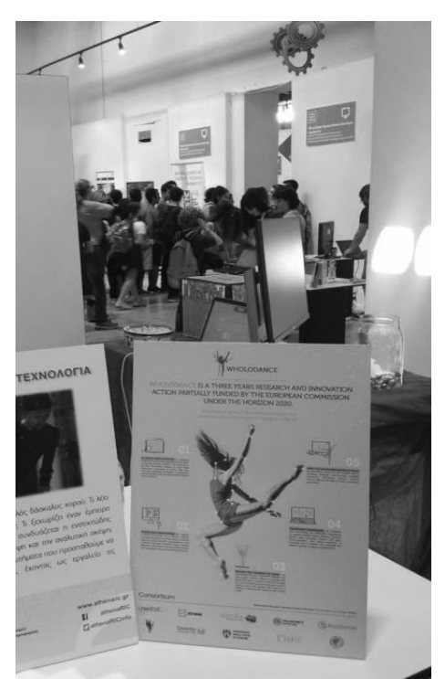
Wholodance Project Poster the Athens Science Festival