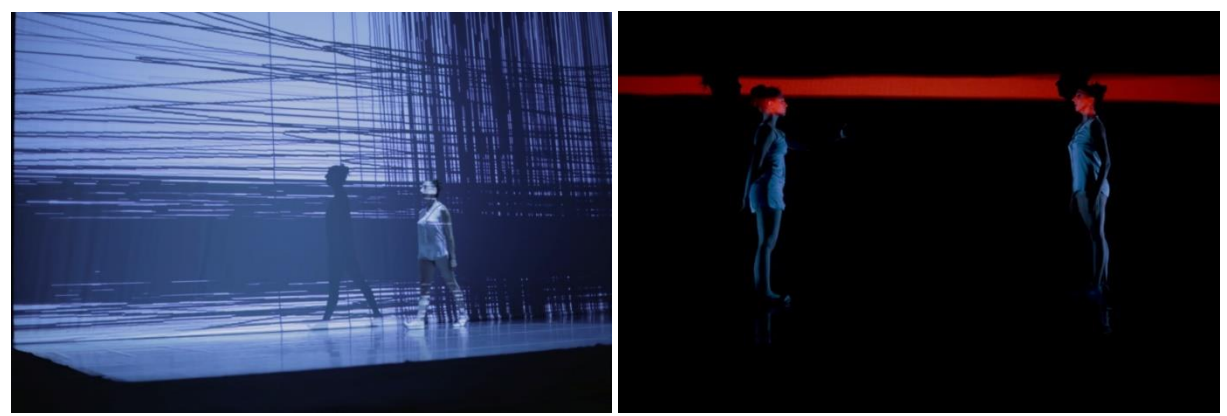
Performance 'Neural Narratives' presented by Stocos in MOCO'16

The workshop brought together experts and researchers from a variety of backgrounds, raising discussions on topics in these relevant areas. The co-organization with MOCO'16 and the close collaboration with the Movement Computing community created an excellent field for exchange of ideas with the wider community not only during the days of the workshop (6th July evening and 7th July) but also during the main conference, since the vast majority of WhoLoDancE partners has not only attended the main conference but also had the chance to present their previous and relevant work during the main-paper presentations, demos and artistic installations and performances. This fact highlights the excellence of the partners, through their involvement in one of the top and state-of-the art conferences which brings together technologies, computing, cognitive science, human computer interaction, movement and art.