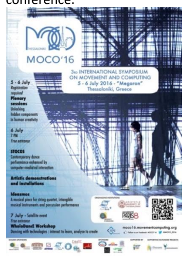
Poster of MOCO'16