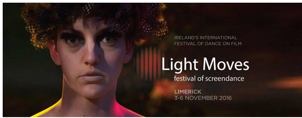
Poster of Light Moves festival