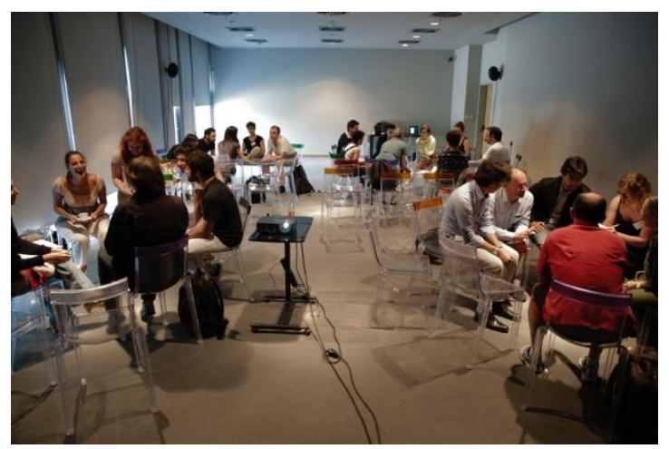
Focus Group during the Workshop at MOCO 2016

The research interests and topics of MOCO'16 and WhoLoDancE are obviously very relevant. For this reason, Athena RC came into communication with the organizers and the community of MOCO since the beginning of February 2016. Following a number of communications, between Athena RC, as a representative of the consortium and a fruitful collaboration with the MOCO organizing committee, we came to a common agreement of having the WhoLoDancE workshop as a satellite event of the MOCO'16, at the same venue. Both events have been disseminated and supported through MOCO'16, WhoLoDancE and Athena RC's webpages, posters and social media. The WhoLoDancE project has been announced as one of the supporting-sponsoring EU projects of MOCO.