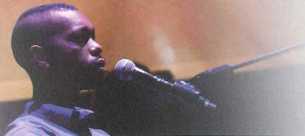
Fig. 3: The Source

One could question, however, whether a musical notion of “composing” is applicable at all to non-auditory events. Can we really say that we are composing theatre as music or is it still, metaphorically, composing theatre as if it were music? The literal meaning, it seems, would ignore the “Eigengesetzlichkeit des Materials” (Adorno 1991: 158), that is, the unique (and differing) material qualities of theatre and music, as well as the unique (and differing) modes of reception of acoustically (music) and visually (theatre) dominant stimuli. The problem with this otherwise perfectly valid assertion lies in the assumption of a clear binary between the aural and visual, between music and theatre. Both are and always have been composite media, and many of their contributing aspects—such as language or sound—contain both acoustic and optical elements and appeal to both the listener and the viewer inseparably. I would thus argue that on a continuum of materiality stretching from musicality to theatricality, the notion of composition gradually shifts from its literal sense (composing theatre as music), via being a simile (composing theatre like music), to constituting a metaphor (composing theatre musically).