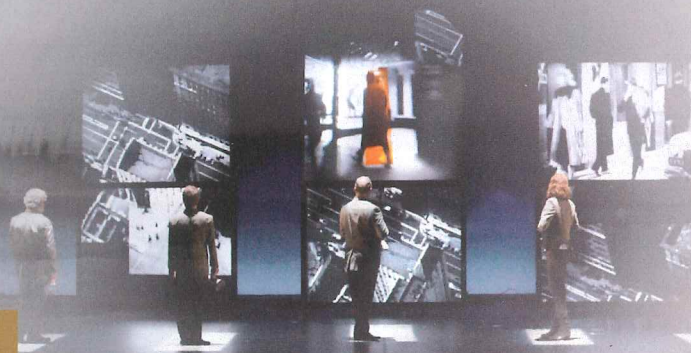
Fig. 2: Private View

We are confronted, then, with hybrid vocal aesthetics, including various degrees and techniques of training and various traces of personal or regional vocal inflections. The effect is a kind of “intervocality” (see Finter 2002)—by which I mean the quotation of, referring to, parodying, and intercutting of vocal idioms and specific audience expectations—often creates a theatrical friction and heightened presence, while also at times fashioning a deliberate critique of the commodification and commercialisation of “voice” in our times. Directly or indirectly, these performances thus thematise voice and its fetishized existence in many music-theatrical traditions. Voice is thus reflected as a highly coded entity, which is disciplined by technique, pigeonholed into vocal registers or “Stimmfächer”, and met with obsessive expectations in terms of sound and virtuosic deliverance. Similar mould-breaking occurs with respect to the nature and the role of “the orchestra”. The orchestra has abandoned the pit—which often doesn’t even exist in the chosen and/or available venues—and varies greatly in terms of size, selection of instruments, and musical idiom. In many cases, however, the act of playing the instruments is itself of great theatrical interest and/or virtually inseparable from the scenic action. A performance such as Shifting Ground , for example, fuses materials, gestures and video