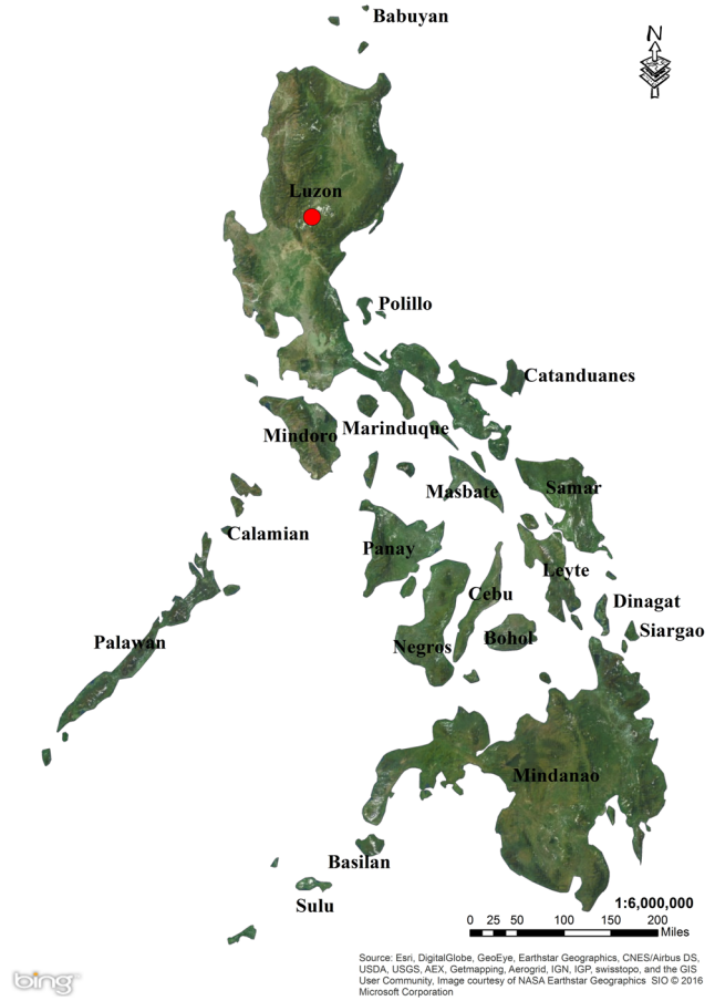
Fig. 2. Distribution map of Acronia marifelipeae sp. nov.

Differential diagnosis. New species similar to A. roseolata Breuning, 1947 (Fig. 1B), from which it differs by the following characters: 1) pronotum of A. marifelipeae sp. n. black (pronotum of A. roseolata indistinctly violet); 2) elytra of new species with two pairs of symmetrically located dorsal yellow-brown spots, scutellar spots more angular (elytra of A. roseolata without dorsal spots, scutellar spots more oval); 3) basal part of 4th antennomere with white pubescence (– basal parts of