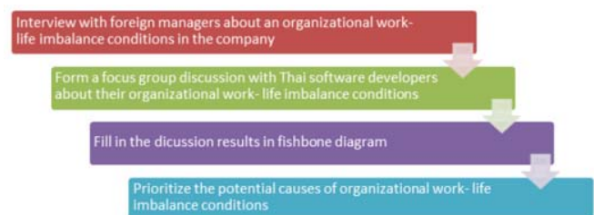
Fig. 1 Root causes analysis process

Many researchers in various fields have applied the fishbone diagram for its usefulness in terms of problem-solving or problem-based learning. In the food sciences and technology, Varzakas et al. [30] use this tool to detect causes of the accumulation of heavy metals in fresh vegetables, as well as the dangers in the stage of cooling, washing and disinfection, packaging and storage, and distribution. It is also useful for medical research. Fluker et al. [9] use fishbone diagrams as a tool in their study. It is used to identify barriers that obstruct exercise counseling in patients with hypertension in clinics. Wong [31] adopts fishbone diagrams for memory assistance and relevant medical case retrieval. In this study, a fishbone diagram is applied to discover potential causes of an organizational working life balance among Thai software developers working in a German-owned software company. The steps of fishbone analysis are conducted according to Fig. 1.