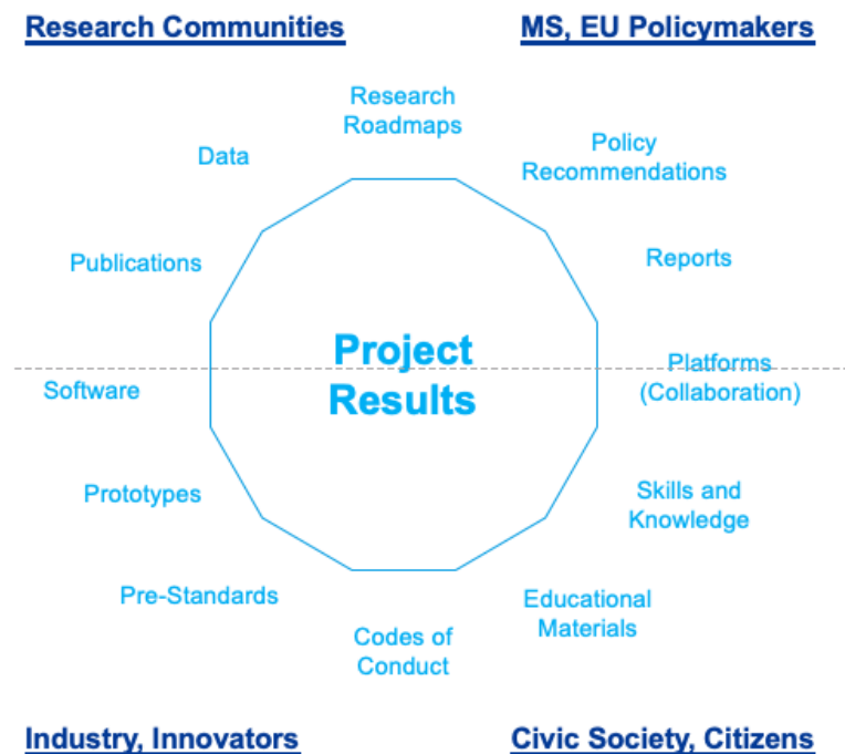
Fig. 2. Types of project results and target groups 2

As shown in the figure below, the results of MILIEU are of interest for future exploitation by a variety of stakeholders related to research communities, policymakers, civil society and citizens.