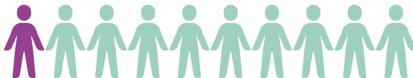
Only 7% of students having experienced gender-based violence in the context of their institution have reported it

What is alarming is that only 7% of students and 23% of staff who participated in the UniSAFE survey and stated that they had experienced gender-based violence within their institution reported the incident.