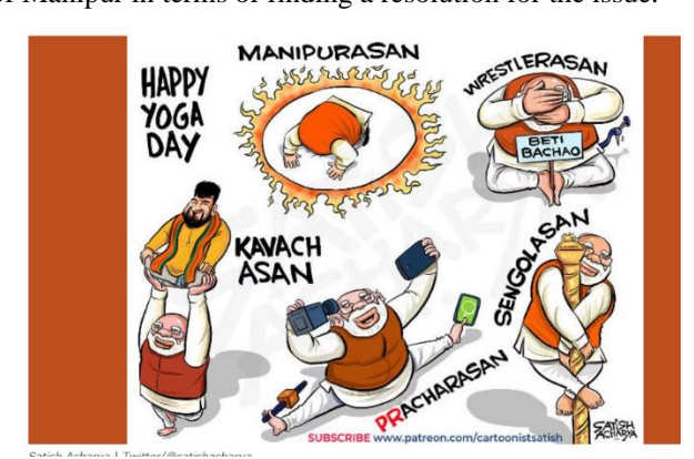
Fig. 2. Happy Yoga Day. Acharya (2023)

[Fig 2: Adhwaryu, S. (2023). Happy Yoga Day. https://theprint.in/last-laughs/on-international-yoga-daywitness-kavach-asan-to-prachar-asan/1635544/. Date accessed: 16 October 2023.]