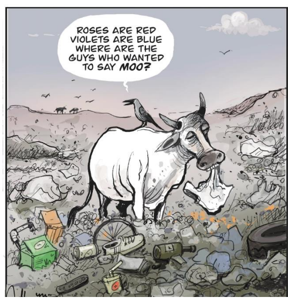
Fig. 4. Roses are Red.... Adhwaryu (2023)

The cartoon Roses are Red .... Fig,4 is rich in symbolism. Both the cow and the crow are sacred animals according to Hindu Mythology (Lochtefeld, 2002). From a zoological perspective crows and cows have a mutually beneficial symbiotic relationship. These two perspectives, one mythological and zoological are cooccurring and point to a polysemy of meaning. It is the presence of the verbal text that anchors the meaning of the cartoon. The blend is multimodally constructed, through both the visual and the verbal mode. The verbal input is a parody of the folksong 'Roses are red' and is a popular cliche for Valentine's Day. The use of the folksong points to deliberate intertextuality within the cartoon text. The other input space is the cow and the crow working as a metonymic group representing the Hindu mythological space. The spatial layout of the cartoon uses the familiar scenario of the garbage dump thronged by crows and cows and reinforces the textual context. Input spaces for the above cartoon are 1) the cow-crow dyad, 2) the folksong 'roses are red' and 3) the image of an expansive garbage pile. The Blend here, THE COW AND THE CROW ARE SINGING A HUMOROUS PARODY OF THE FOLKSONG IN A GARBAGE DUMP works as a deixis and refers to other news items that imply move by political groups who wanted to celebrate the 2023 Valentine's day as 'hug a cow' day. The blend here works through elaboration by fitting in elements that can work as explanatory devices of the communicative event.