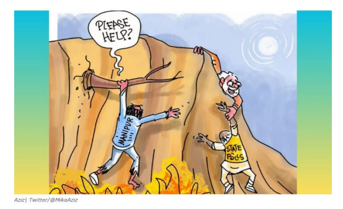
Fig. 1. Please Help. Aziz (2023)

[Fig 1: Aziz, Mika. (2023). Please Help. https://theprint.in/last-laughs/karnataka-electionssideline-manipur-violence-fuss-over-40commission/1563710/. Date accessed: 16 October 2023.]