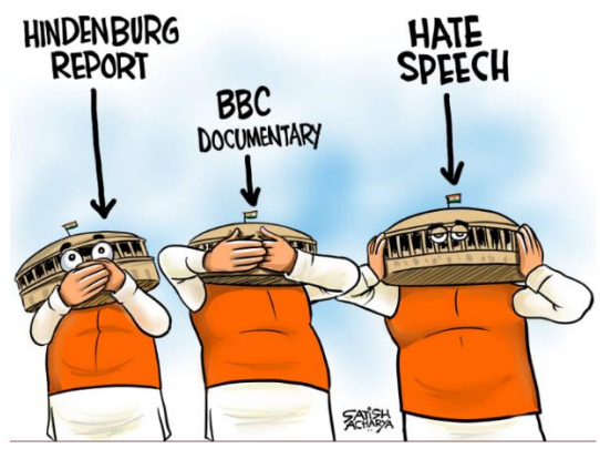
Fig. 3. Three Politicians. Acharya (2023)

symbolic of the party and its model of politics and governance. The blend is created in this frame with the aid of two inputs the visually cued person performing Yogasana and the verbally cued portmanteau of Manipur and Asana that refers to the Manipur crisis. Like the example of cartoon 1. This cartoon again has input spaces from two different domains and compresses a disarray of meaning into the blended space YOGASANA IS MANIPUR CRISIS. However, this is only part of a network of other blends in the same semioscape.