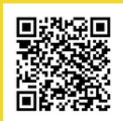
MEI Code of Conduct