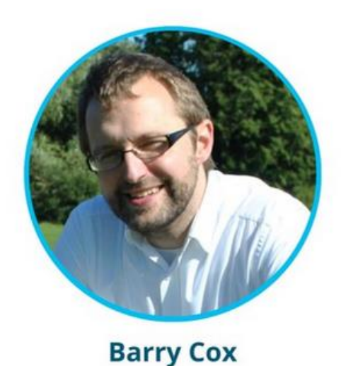
Standards Officer The National Standards Authority (NSAI)