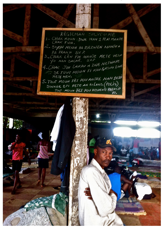
Figure 4 - A blackboard at the entrance of the shelter prohibits, prescribes and informs migrants of established rules for using the space