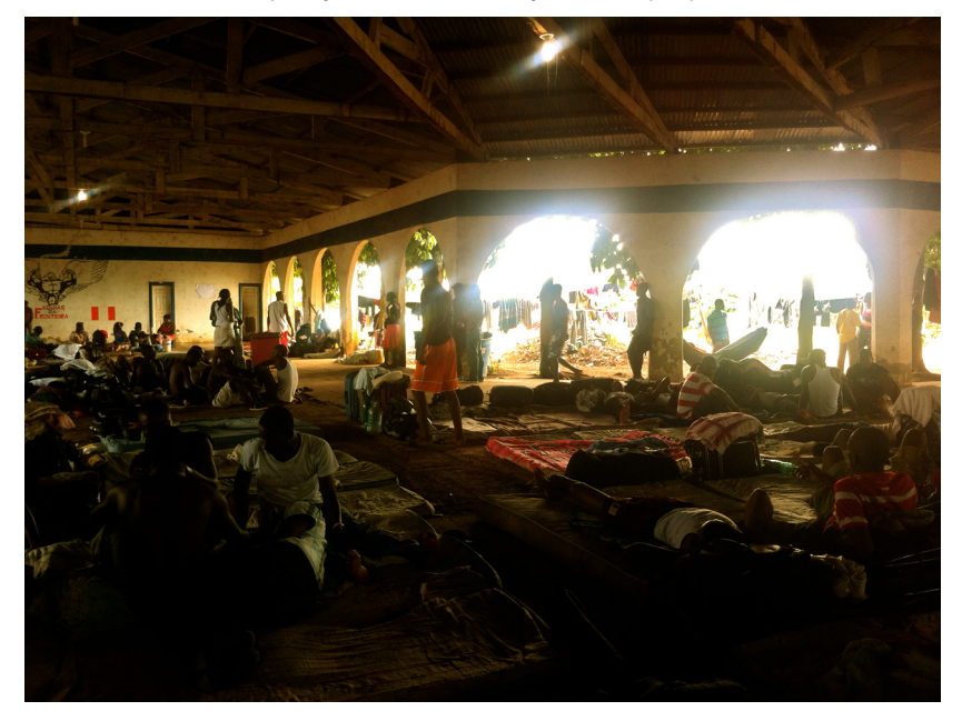
Figure 2 - Haitian migrants await information on the Temporary Shelter, where a capacity of 200 is shared by over 400 people

about life, confabulating, playing cards and even (some) using their skills – hairdressers and barbers – in exchange for a couple Real bills (the local currency).