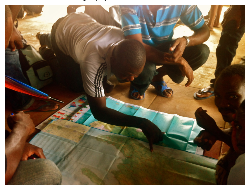
Figure 1 - Informants observe maps during group dynamics in the shelter

the much-appreciated opportunity to meet them, creating opportunities for in-depth interviews and further observations.