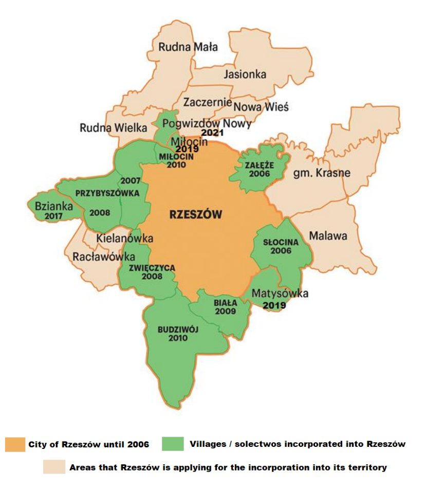
Figure 19: Territorial development of the City of Rzeszów <sup>186</sup>

The City of Rzeszow is planning further requests for the incorporation of further villages (solectwos): a part of the area of the solectwo of Raclawowka (Racławówka) from the Boguchwala (Boguchwała) commune, the area of the solectwo of Zaczernie and Nowa Wies (Nowa Wieś) and a part of the area of the solectwo of Jasionka from the Trzebownisko commune and the incorporation with the entire Commune of Swilcza (Świlcza). In the consultations, the residents of all these areas were against incorporating them into the city. There is an international airport (14 km from the center of Rzeszow) and the Podkarpackie Science and Technology Park Aeropolis in the area of the solectwo of Jasionka. In consultations in 2015, 96.41 per cent of the residents of Jesionka were against the incorporation into Rzeszow.