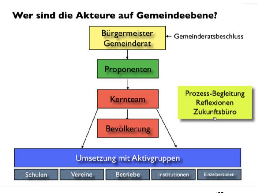
Figure 3: Actors within 'Zämma leaba – Living together'. 137

not only results in wide impact, it also signals the openness of the process (non-partisanship) and the importance of the topic (sustainability/Enkeltauglichkeit). The link between the volunteers and their projects and politics is the core team. Reporting regularly on the progress of the projects in the meetings of the municipal council is one of the core team's tasks to create linkage with the overall political process.