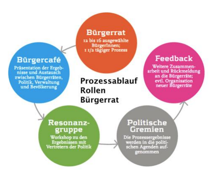
Figure 2: Process flow of a Bürgerrat. 134

and the absence of any special expertise or qualifications, the participants' everyday knowledge is put in the foreground. Furthermore, the special moderation technique 'Dynamic Facilitation' enables breakthroughs in solution finding.