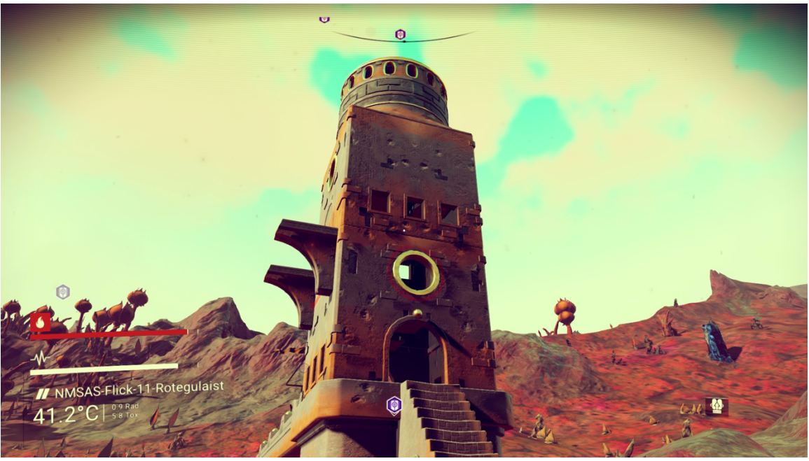
Figure 2: Ruin site

Another discussion was about context integrity, a must for real world archaeological sites. While archaeonauts can interact with certain "monolith" sites in game, there are other "ruin" sites which had archaeological items which were immovable, such as pots, broken parts of sculpture, and large gold balls (an example can be seen in Figure 2). The archaeonauts were disappointed that they could not pick up and inspect some of these objects, but it turned out some were accidentally interactable with: "I was walking around a big temple, one of those types with a big gold ball. I bumped into it and it rolled down the walkway. I moved it again and it fell over the side. And then I kind of played football with it." To which another member wrote: "adds "do not play football with monoliths" to the list" (which can now be seen in the last item of the Practice section). However, this sparked the discussion about archaeological context integrity and how the game is extremely limiting when it comes to interaction with these types of monuments. "I couldn't believe I finally had agency", said the original "footballer".