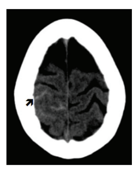
Figure 1. Admission noncontrast brain CT shows SAH involving the convexity of the brain in the parasagittal region of the right side (black arrow).

A 54-year-old right-handed female smoker, with history of attention deficit disorder (started sympathomimeticpseudoephedrine-medication a months prior) and episodic attacks of migraine was admitted to the hospital after an abrupt onset of thunderclap headache followed by nausea, vomiting, and temporal disorientation. The neurological examination as well as fundoscopic examination was normal. A noncontrast head CT showed subarachnoid hemorrhage involving the convexity of the brain in the parasagittal region on the right side (Figure 1). CTA of the head showed no evidence of vascular abnormalities. MR venogram of the head showed no evidence of sinus thrombosis of cortical vein thrombosis. A fourvessel cerebral angiogram showed intracranial vasculopathy consistent with multiple areas of stenosis and dilatation involving the cortical branches of bilateral ante-