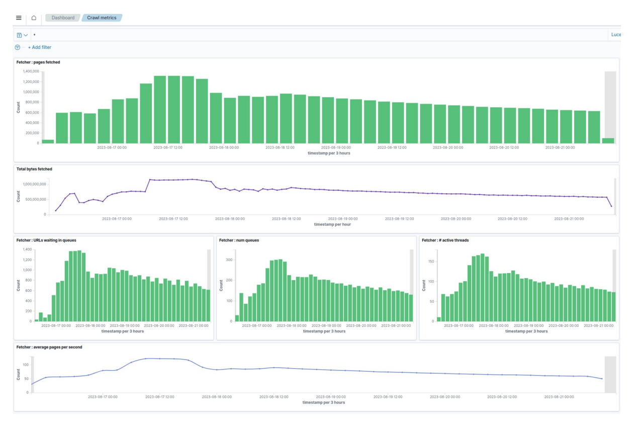
Figure 2: Screenshot of our metrics services for seeing page fetches, number of treads and queue status.

We have developed dashboards to get insights in the crawling behaviour and the crawled websites. The following screenshot shows the dashboards on page fetches and crawled URLs. The second dashboard allows for (a limited) content-based analysis of the current crawling status, by analysing http-status codes, statistics of domains-crawled etc.