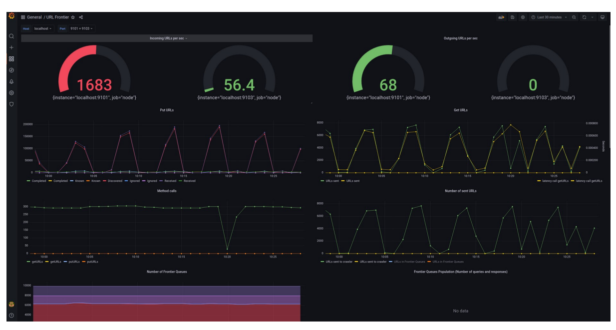
Figure 5: Grafana Dashboard for crawling sites accessing the OWS Frontier

The OWS Frontier also serves as point for monitoring the operational status of our services. We collect API request statistics via a Grafana instance, as shown in the screenshot below. Thus, we can observe the operational status of all participating crawling sites in a single dashboard. Note that the Grafana instance monitors the operational metrics for our services, while the ows-metrics service monitors the content-based metrics.