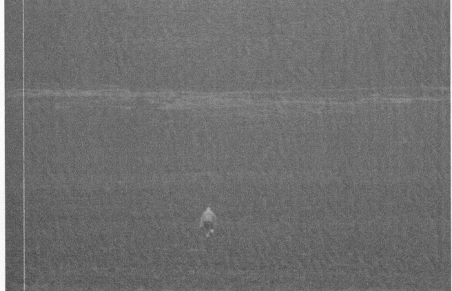
FIGURE 2. Lead author disguised as a polar bear approaching a group of Svalbard reindeer. Limited supplies of white clothing left the back of the observer uncovered.

displacement distance by the reindeer after taking flight. All response distances were measured with laser monoculars (Leica Rangemaster 1200 Scan; 1 m accuracy at 1000–1200 m).