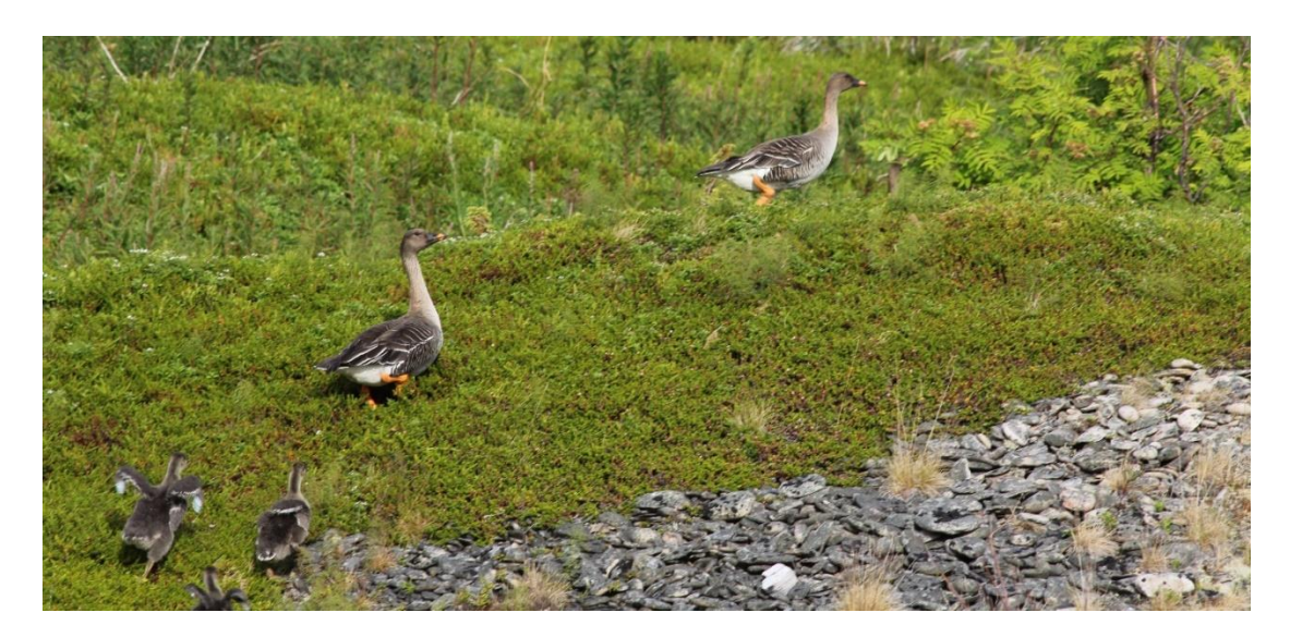
Figure 2. Two adult tundra bean geese Anser fabalis rossicus with chicks on the southern part of Kildin Island

Even though the bean goose is common, although not abundant, in the Murmansk region (Khlebosolov et al., 2007, Buzun et al., 2019), its breeding, feeding ecology and migration patterns on the Kola Peninsula have not been sufficiently studied. Several studies conducted in other regions indicate that the migration route of bean geese of different subspecies passes through the Kola Peninsula and the White Sea (Noskov et al., 2016, Bianki and Boiko, 2022), which aids the study of the species' migration in the aforementioned areas. Some breeding sites of the tundra and forest bean geese are also known here, which may be the basis for continued studies on the breeding and feeding ecology of stated subspecies. Continued studies of the tundra bean goose on the territory of Kildin Island may also become the basis for larger-scale studies of the tundra and forest bean geese in our region.