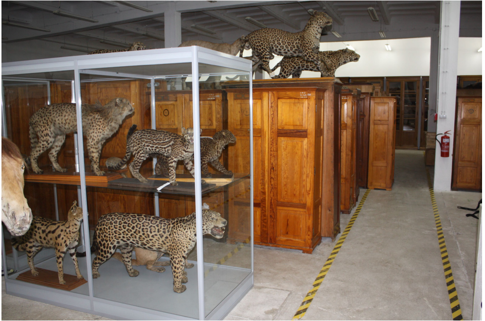
Fig. 1. View of the Mammals collection of the Museum and Institute of Zoology PAS, Warsaw. To the left, in the back, old fashioned wood cabinets can be observed.