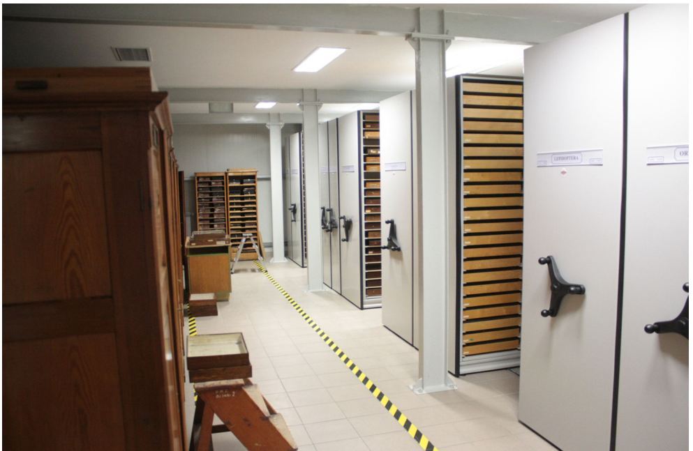
Fig. 2. Insect Collection of the Museum and Institute of Zoology PAS, Warsaw. To the left the old wood cabinet can be observed. A set of modern cabinets were installed to the always increasing collection and can be observed to the right.