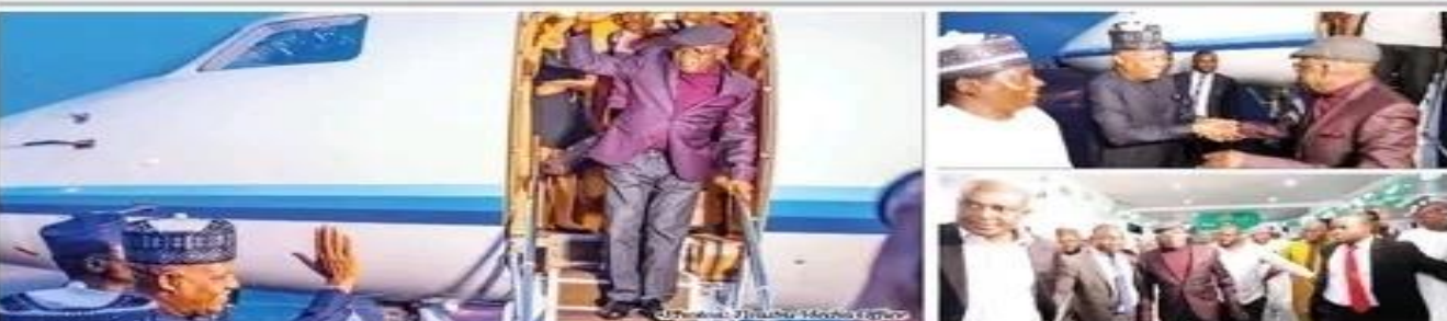
Excitement as Tinubu returns from UK, prepares for campaigns

Ogun monarch allegedly blinds trader for dancing with queen Page 4, 5, 6