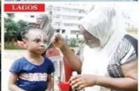
Fun seekers at the Magicland, Abuja and Johnson Johnson's Park, Lagos, Lagos during the Independence Day holidays, on Monday.

Syndicate denies injecting child beggars, police hunt doctor