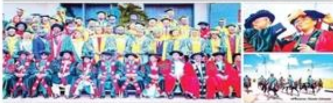
NDA convocation: Osinbajo advocates local manufacture of arms, ammunition