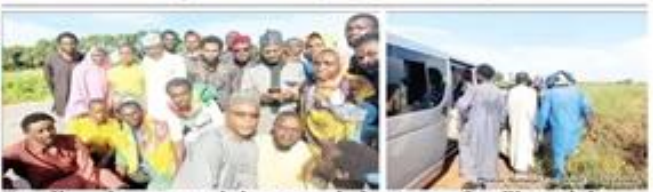
Bandits release remaining 23 train hostages, families rejoice

Kanu mustn't die in detention, Ozoekwu writes Buhari Page 16