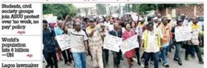
Students of Oshodi Staff Union of Universities (OSUU), students and civil society groups at the University of Lagos, making protesting as work, no pay policy for university lecturers.

Hits 17-year high - Prices of gas, liquid fuel, air transport record highest increases - NBS blames disruption in food supply, currency depreciation