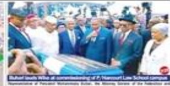
Various news snippets and small images related to the election and other events.

"My husband told me 'I will set you ablaze,' and he did it"