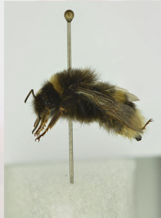
Bombus terrestris (Linnaeus, 1758)