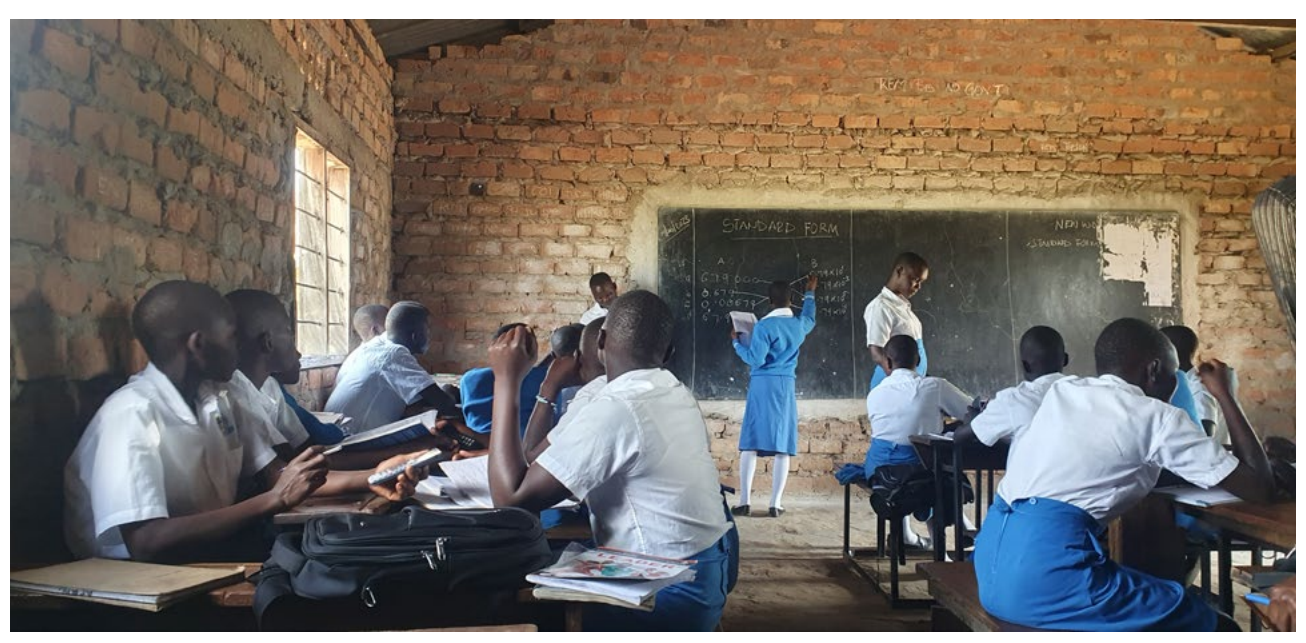
Secondary school classroom in northern Uganda