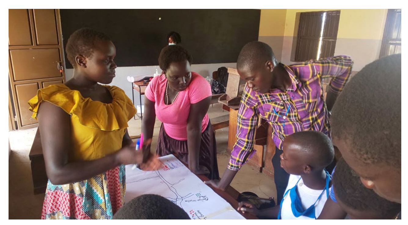
Students at a secondary school in northern Uganda, mapping their village during a group discussion