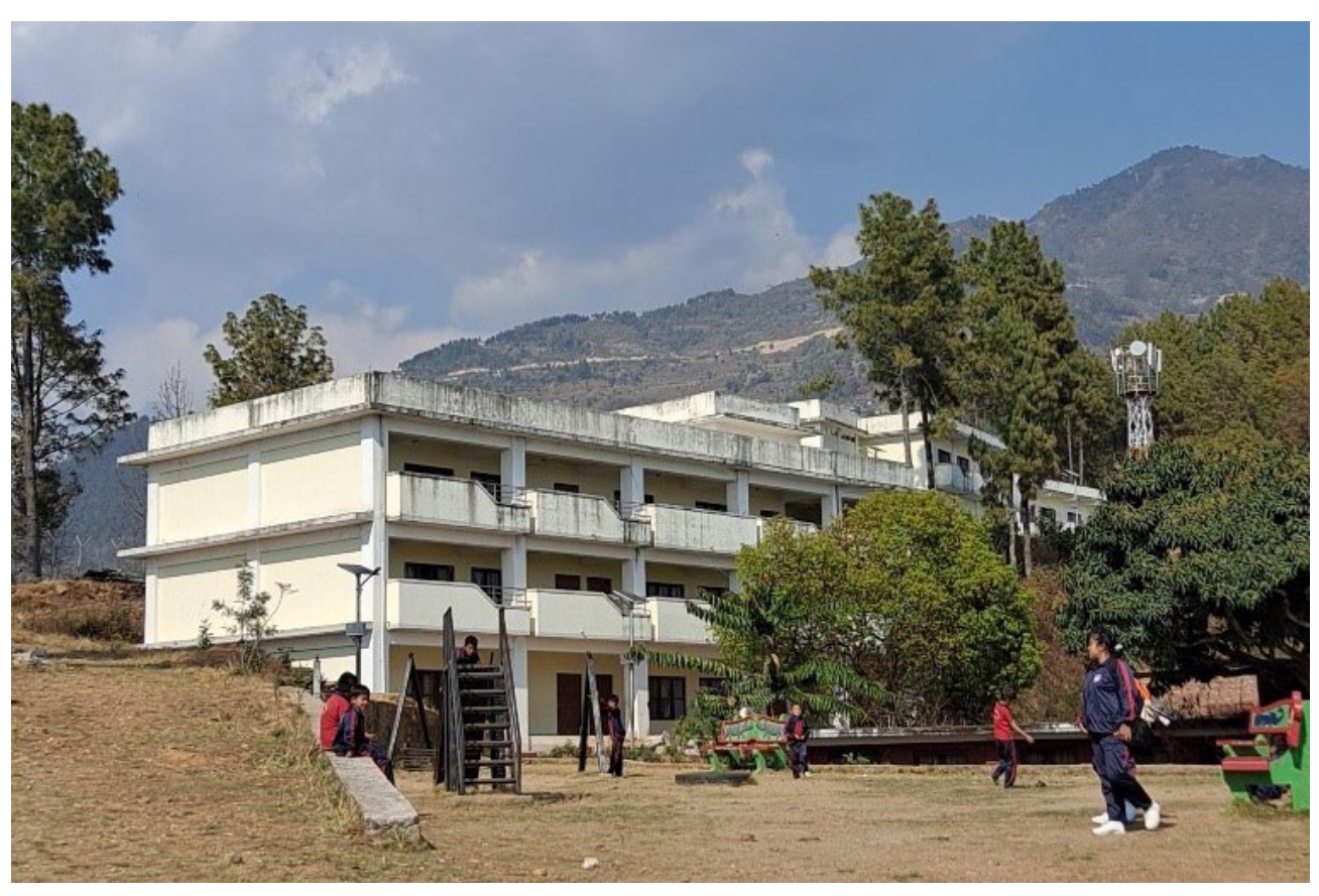
Secondary school in northern Nepal