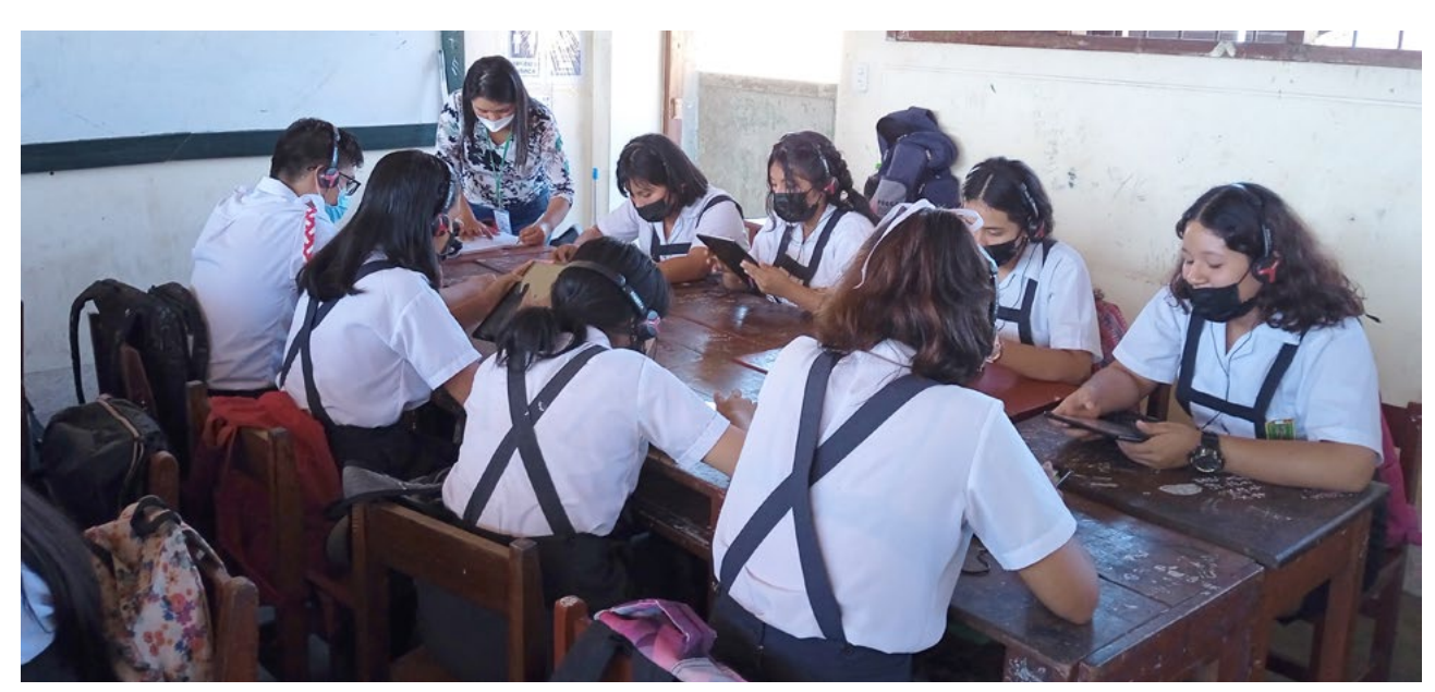
Secondary school learners in a classroom in Huaycán, Peru, during the COVID-19 pandemic