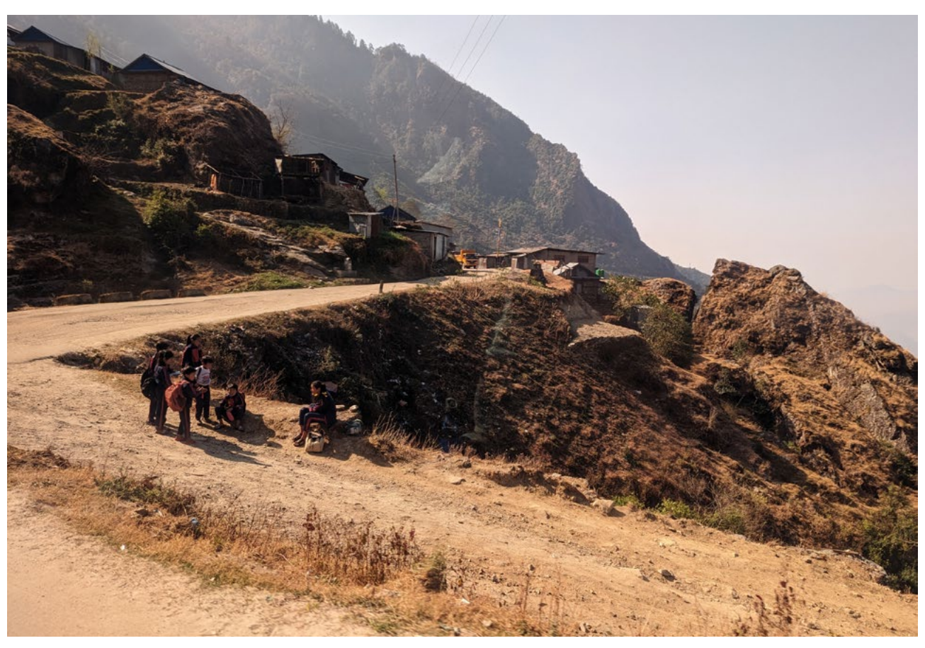
School children waiting for the bus in northern Nepal