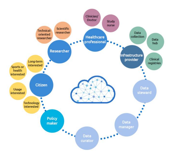
Figure 1: FAIR health data portal user profiles and sub-profiles.

Eight different profiles and their corresponding sub-profiles (Figure 1) were considered to define the user interactions with the FAIR health data portal, which were grouped into the six orthogonal categories -1) data generation and usage; 2) legal roles health-related infrastructures; 3) career development of a given professional; 4) intended use of health-related data; 5) professional sector of the main activities of a given professional; 6) temporal scale of the activities considered. These orthogonal concepts were designed to capture relevant aspects for the users' profiles when interacting with the FAIR health data portal.