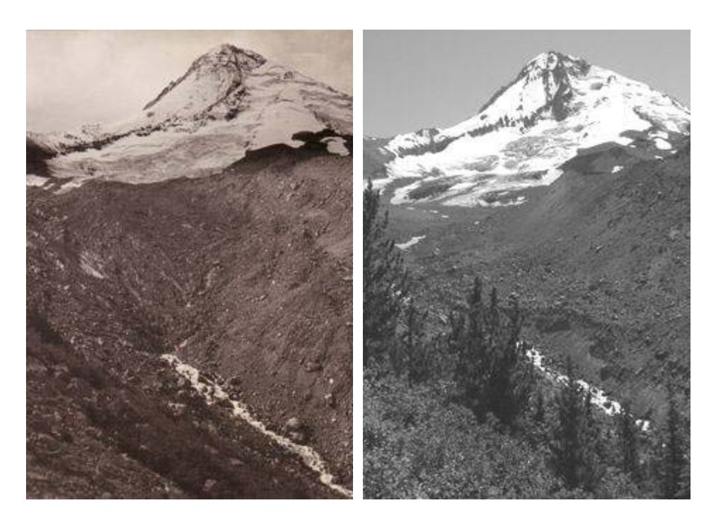
Left image taken Sept 15, 1935 by A.J. Gilardi (courtesy the Mazamas). The rock-covered glacier terminus is visible in the center of the photo (note where the stream begins). Right image taken July 22, 2005 by K.M. Jackson. Note the glacier has deflated and the stream starts farther up-valley.

The Gnarl Ridge Fire was started by lightning on August 7, 2008 on the north flank of Mt. Hood. It was contained by late August at 516 acres. On September 16, unusually hot and dry conditions coupled with a persistent thermal belt during the night caused the fire to make a major run shortly after midnight. Historic Cloud Cap Inn and the structures at Tilly Jane were saved from the fire. Fire personnel continued to extinguish remaining hot spots until heavy rain arrived on the fire on Friday, October 3. The rain reduced the potential for the fire to spread and made working on the fire hazardous due to slick roads and more falling trees. (Mt. Hood ICS Report, 10/2008)