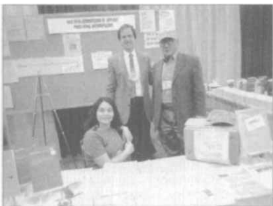
Applied Anthropology Booth sponsored by the AAA/SfAA Commission on Applied/Practicing Anthropology.

If you would like to share your views on these suggestions or offer additional ideas, we invite you to participate in one of the following NAPA working groups: shaping the public image of anthropology; supporting career and organizational development; creating opportunities for information and resource exchange among professional anthropological researchers and practitioners; building community among students and professional practicing anthropologists by communicating effectively with our members. Please con-