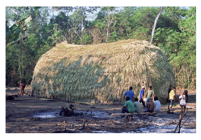
Figure 4: A traditional Suruí house, rather small, built in 2005 near Lapetanha