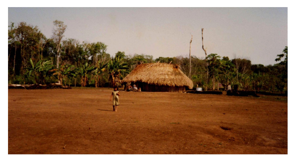
Figure 2: A Trumai village, with its central area

are expected to be present in large numbers around the grave. After this, the fish are shared and distributed to the whole village. A fire is placed on the grave for the next three or four days, the time necessary for the deceased person's soul to go away to the village of the dead.