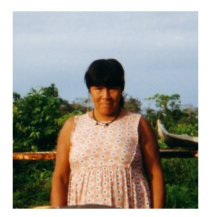
Figure 3: Kumaru, the narrator of the Trumai myth