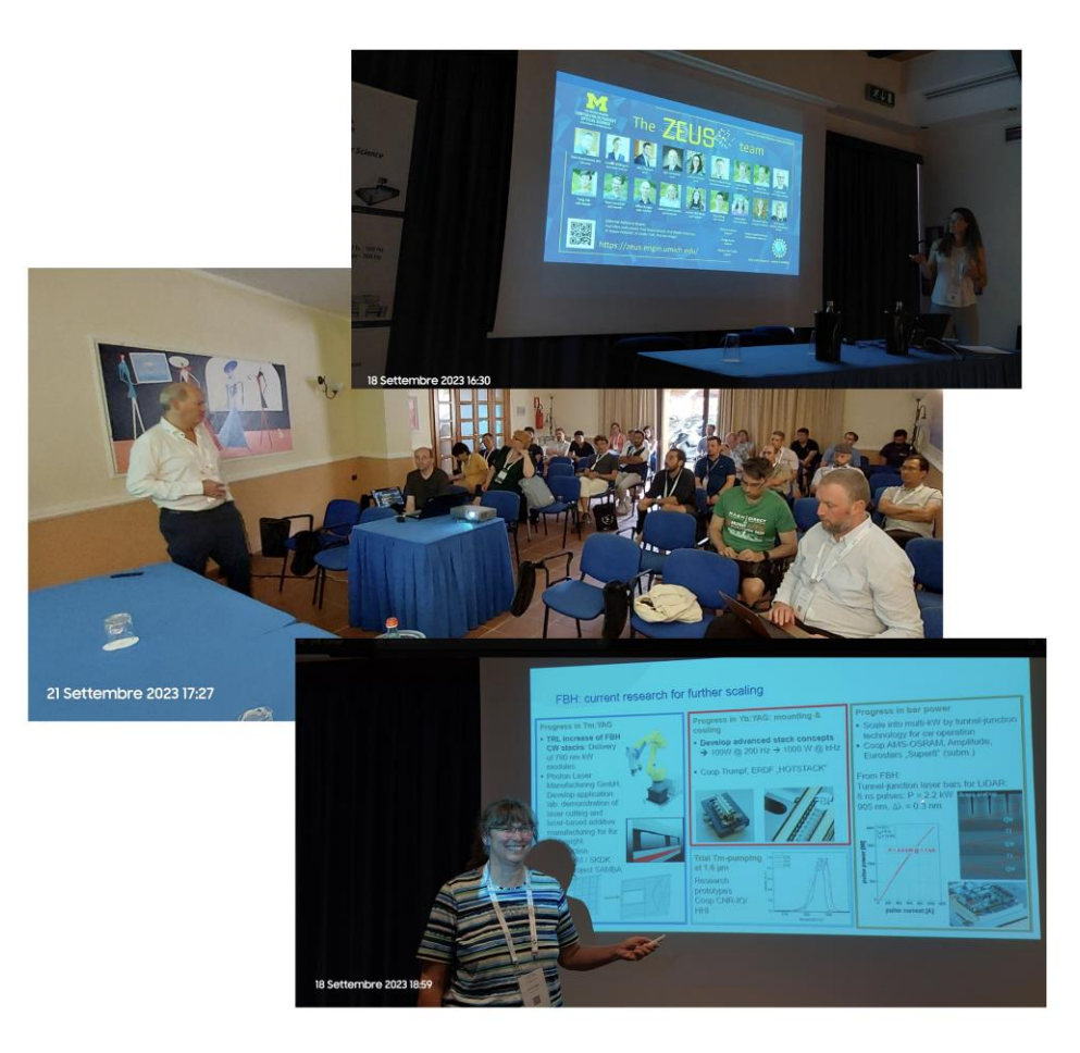
Figure 3: Images from the IFAST LASPLA Laser Technology Workshop held on 19<sup>th</sup>, 20<sup>th</sup> and 22<sup>nd</sup> of September 2023 in the framework of the EAAC 2023 at Elba, Italy.