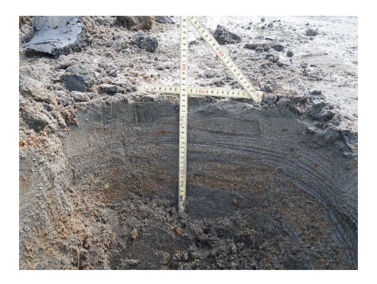
Figure S2. The tsunami deposit at Loc. 1 (See Figure 1C and Figure S1 for location and lithofacies). The sand layer exhibits a distinct normal grading structure and parallel lamination.