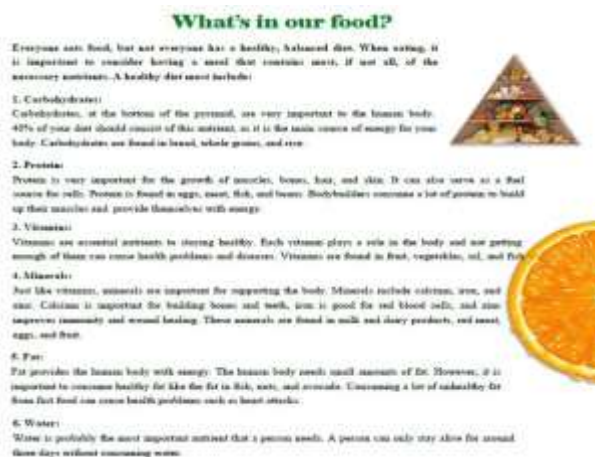
Figure 1: The reading Text

The following slides demonstrate a sample of educational mapping as a game.