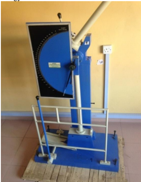
Figure 4: Charpy Impact Testing Machine

Figure .4 shows the Charpy impact testing machine and figure .5 shows the sample of the work piece with the rivet tested of impact energy.