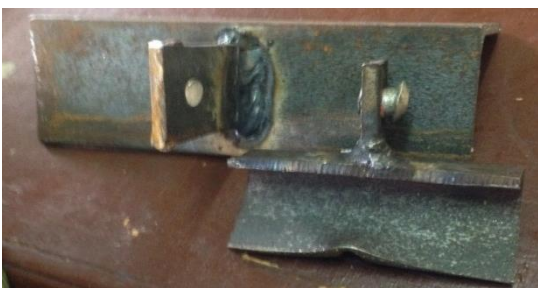
Figure 5: Sample of the work piece after Impact Test