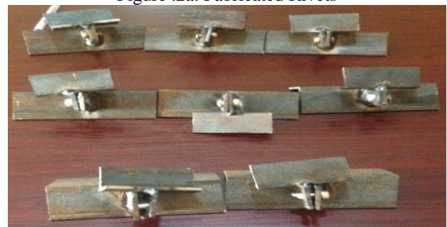
Figure .2b Fastened work piece samples with the three rivets