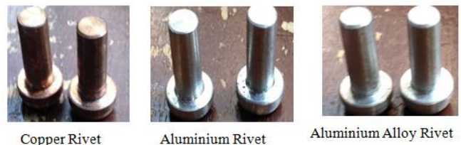
Figure .2a: Fabricated Rivets

The riveting process consists of inserting the rivet in matching holes of the work piece to be joined and subsequently forming a head on the protruding end of the shank. The diameter of the hole on the mild steel is 8mm and greater than the nominal diameter of undriven rivet. The head is formed by continuous pressing using a shop press, then fastened to work piece. Figures .2a and .2b show the rivets and the work piece samples fastened using the three rivets. Figure.3 shows the press machine used for fastening rivets.