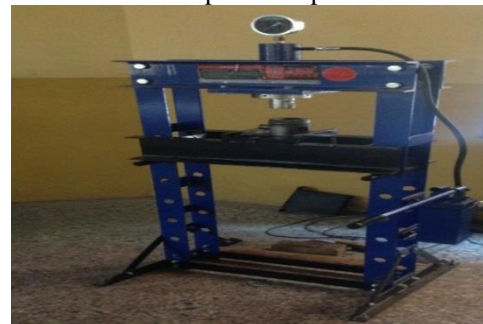
Figure 3: Press machine

A riveted joint may fail in several ways. The following are the common modes of failures of a riveted joint: