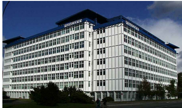
Foxconn Factory, Shenzhen

Foxconn tragedy has been dubbed the "suicide express" by Chinese media. 7