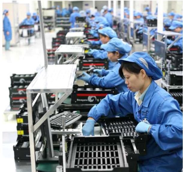
Foxconn workers on the assembly line

demographic changes in the national working population as a result of the one-child family policy implemented beginning in the 1970s, successive generations of rural-urban migrants and the potential pool of migrants in the countryside have been and remain large. Chinese migrant workers have been incorporated within a global industrial labor regime.