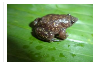
Figure 2a. Hemisus sp