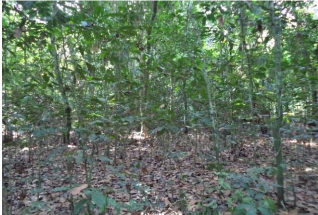
Figure 4. Habitat (primary forest) where Hemisus sp were captured