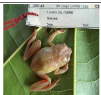
Figure 1b. Hyperolius sp