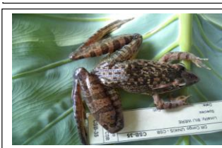
Figure 3a. Ptychadena cf aequiplicata