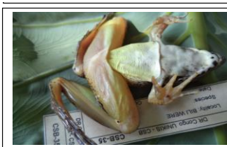
Figure 3b. Ptychadena cf aequiplicata

The survey recorded 16 morphospecies of amphibians. However, the result of the current survey shows that the species lush of Kponyo village is less compared to previous surveys [1, 7, 9, 13, 21-24]. The amphibian investigation in Yoko and Masako reserves listed 18 and 30 species respectively [25]. Another survey carried out in two protected areas of Province Orientale (Tshuapa Lomami Lualaba, Rubi-Télé) and UMA forest revealed that 29 species of amphibians are known in Kisangani ecoregion [26]. Compared to the current survey, it is clear that this area is not rich in amphibian species. However, the current estimation of amphibians in Kponyo village does not reflect the total amphibian fauna of this area because of the lack of knowledge of this fauna. Thus, a long duration intensive investigation is required in increasing the number of habitats and microhabitats in order to describe a number of species of this eco-region [9]. Given that the intact state of the forest with its cover canopy, the probability of identifying a number of species is very high.