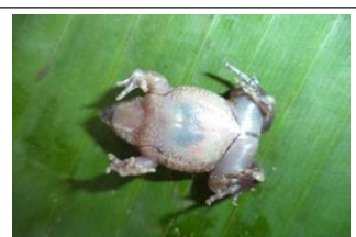
Figure 2b. Hemisus sp