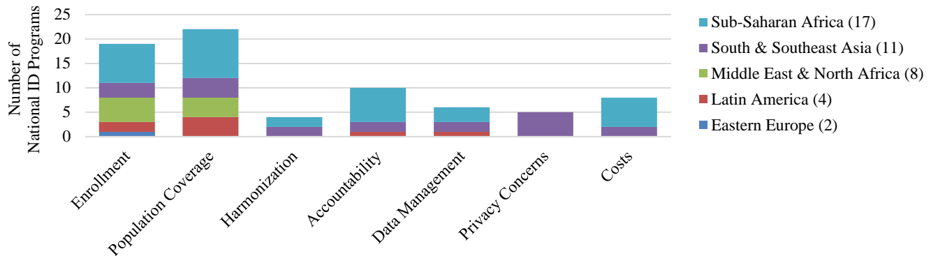
Figure 3. Implementation challenges of national ID programs, by region.

Finally, though technology costs related to national ID program enrollment, ID card production, and distribution are generally falling, we find evidence of challenges relating to lack of funding for eight national ID programs. Financial and capital shortfalls have led to delays or indefinite suspensions in national ID program enrollment and ID card production in five programs. Other programs have faced funding challenges related to cost of ongoing maintenance, limiting the use of the program even after successful enrollment efforts. Beyond population size, program implementation costs increase in countries with more remote populations and for programs with more advanced electronic card features or incorporating biometric information. Incorporating biometric information requires additional equipment for enrollment and registration as well as for any services using the biometric information for authentication. While many programs incorporate biometric features, few actively conduct on-site biometric authentication for service provision, largely due to costs.