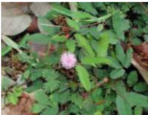
Mimosa pudica leaves and flower