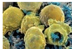
Microbial Biofilms-----> Surface Protection

He also reported that many bacteria including certain strains of Shewanella can prevent pitting of Al 2024 in artificial seawater and rusting of mild steel and reduce corrosion rates of different metals and alloys in many corrosive environments. MIC inhibition is not often linked to a single mechanism or to a single species of microorganisms. The formation of microbial biofilms mediate the interactions between metal surfaces and the liquid environment, leading to modifications of the metal–solution interface by drastically changing the types and concentrations of ions, pH, and oxygen levels.