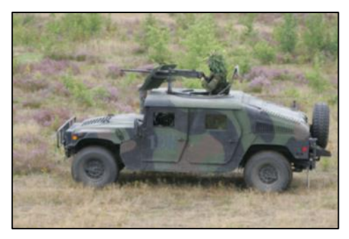
Figure 5 'Bradley' Infantry Fighting Vehicle (left). Model M111 Armoured vehicle 'HMMWV' (right).