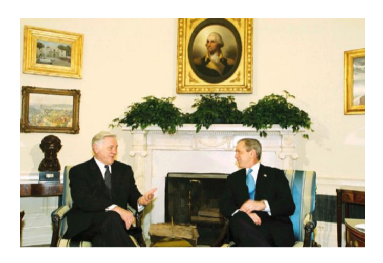
Figure 2 Lithuanian President Valdas Adamkus<sup>i</sup> meets with the U.S. President George Walker Bush on January 17, 2002, in the White House, Washington D.C. (LRP 2002)

would lead towards joining NATO (Figure 2). In 2014, more intensive meetings were held to emphasize that the Russian annexation of Crimea in the Ukraine could also turn out to be a threat towards the security of the Baltic countries. Therefore, active engagements at the Presidential and other levels were aiming to ensure there was political and military support primarily from the U.S. In 2017, intensive collaboration was held to discuss Russian/Belorussian military exercise 'Zapad' which was conducted near Lithuanian borders. 'Zapad 2017' exercises were treated as an expression of conventional threat against Lithuanian existence (LRP 2017b).