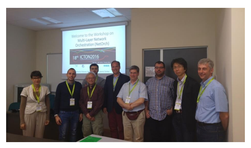
Figure 3.1: Picture of the NetOrch Workshop: chairs and speakers of the second session.

ACINO organised the first Workshop on Multi-Layer Network Orchestration (NetOrch), co-located with the 18th International Conference on Transparent Optical Networks (ICTON 2016) [ICTON2016] and held in Trento, Italy, in July 2016. The conference benefited from the technical co-sponsorship of the IEEE and the IEEE Photonics Society.