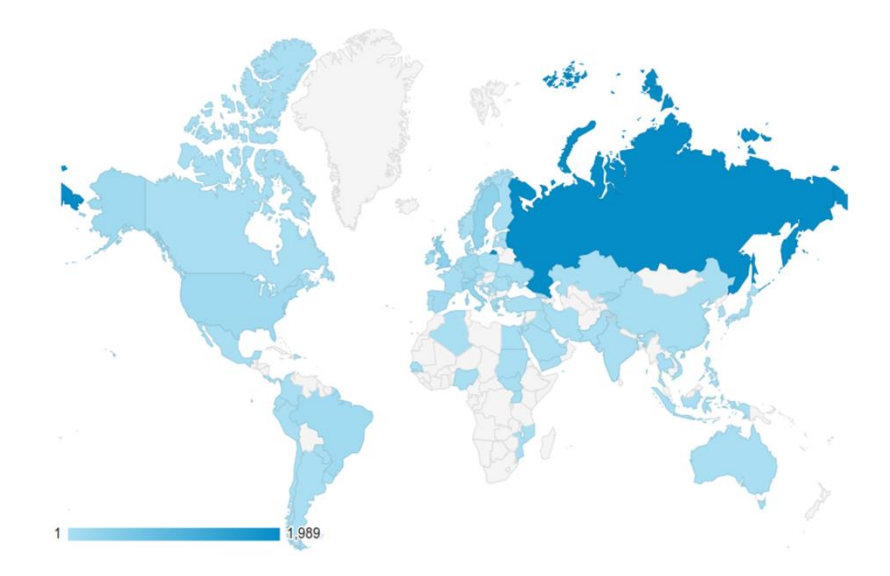
Figure 2.3: Map showing which countries have accessed the ACINO website during the second year (from Google analytics).