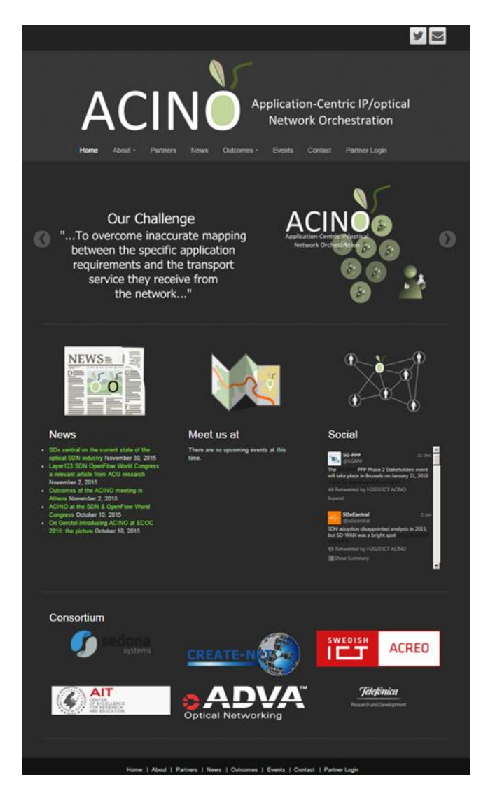
Figure 2.1: Front page of the project website, located at www.acino.eu.