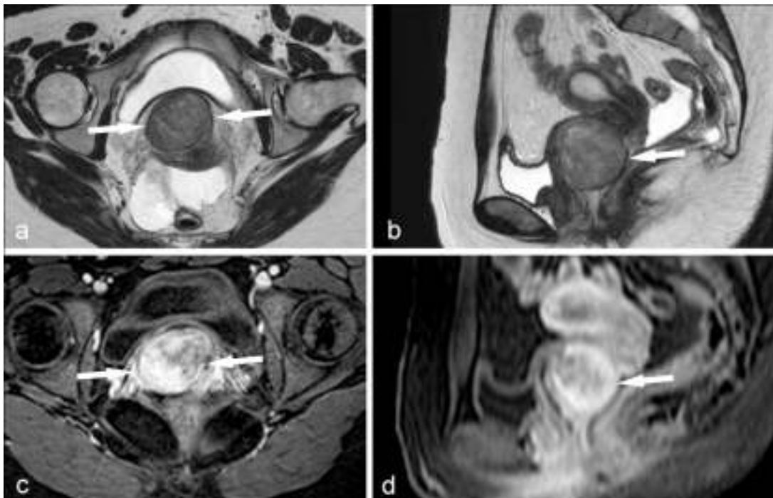
Fig. 2. MR of pelvis. TSE T2 axial (a) and sagittal (b) images. Voluminous, round-shaped well delimited formation at posterior vaginal fornix occupies a large part of vaginal lumen (arrows). Axial (c) and sagittal (d) THRIVE images after m.o.c. . Neof ormation shows intense and disomogeneous vascular enhancement (arrows)

Microscopically it was a cellular leiomyoma of the vagina arising on vaginal adenosis with ulceration of mucosa. Immunohistochemical reaction was positive for desmine and smooth muscle actine, negative for ck-pool, CD34, S100, HMB45. Ki <5%. Fig. 3A & 3B.