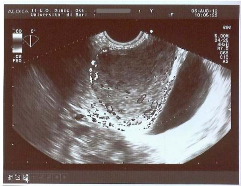
Fig. 1. A: Transrectal 2D Ultrasonographic scan showing uterus (red arrow), vagina (white arrow) and the hyperechogenic inhomogeneous mass (black arrow). B: Transrectal ultrasound doppler of the mass showing peripheral vascularization