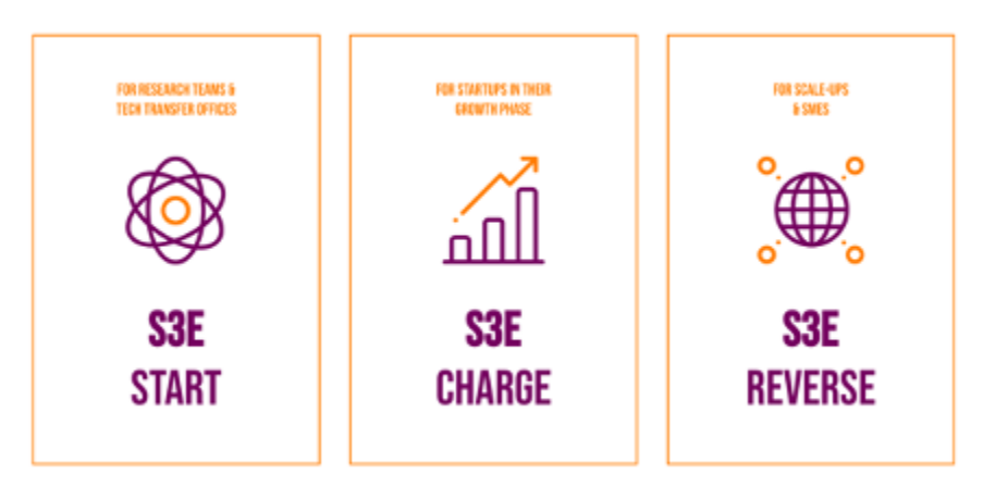
Figure 2. S3E Tracks

Research teams, technology transfer officers, growth startups and scale startups will be selected through an open call. This open call targets science and technology excellence in these fields: agricultural sciences, engineering and technology, life sciences, and natural sciences. This document focuses on the S3E Charge and Reverse Tracks and their open calls and documentation.