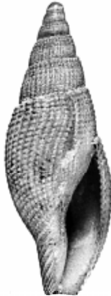
Fig. 1. Antimitra [= Metula ] aegrota (Reeve, 1845): Syntype of Pleurotoma aegrota , BMNH 1963924, Singapore, 7 fath. [= approx. 13 m]; 10.5 x 3.7 mm.

Of described turrids, I refer the following Recent species, which have been distributed in the published literature amongst a wide range of different genera, to Otitoma . I have examined types of all species, with the exception of Hemidaphne gouldi for which