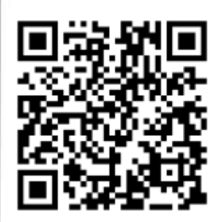
Figure 3. The final part of the mosaic task created on the "LearningApps" portal on the topic "National and religious structure of the world's population".

In the modern world, the form of distance education is also widely implemented. In such conditions, the LearningApps portal serves as a good tool for home, distance and online learners. When the student studies the topic "National and religious composition of the world's population", the task can be completed using the QR code (https://learningapps.org/view27365788) (Fig. 4). This will provide practical help to ensure that the information is more complete and understandable for students. Also, students can repeat tasks.