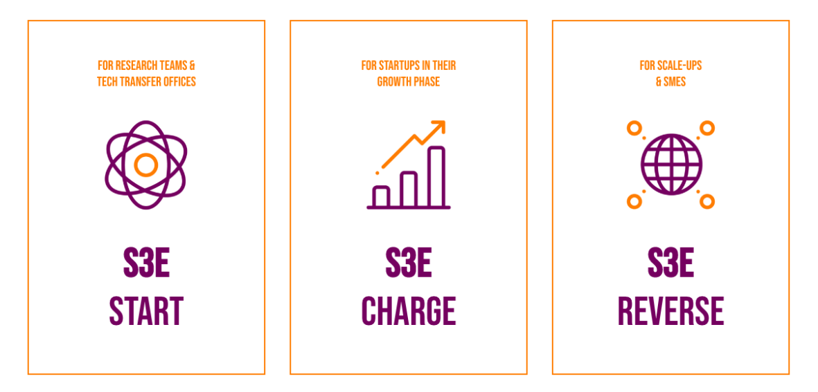
Figure 1. S3E Tracks

S3E Reverse: For scaling start-ups, S3E will set up an Open Innovation ecosystem to broker, connect and match corporates to scaling start-ups through a challenge-solution duality.