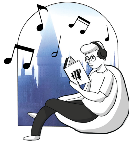
Figure 1. We aim to transport readers to a musical universe by building a dense and coherent book soundtrack that is borrowed from movie adaptations.

In 1975, a short repetitive piece of orchestral music gained notoriety for inducing fear in its listeners, putting them in a suspenseful state of impending doom. Today, it still induces the same reaction, right when the iconic shark of the movie Jaws appears on screen. Movie composers, such as John Williams who created the Jaws theme, have long been aware of the impact music has on its listeners. Well-placed music can accentuate scenes to raise the emotional stakes or foreshadow upcoming events; ill-suited music can even suggest that something evil is afoot [1]. When taken as a whole, the musical imagery afforded by such soundtracks greatly complements the movie watching experience. In this paper, we attempt to answer whether we can create a similar experience for books ( cf. Fig. 1).