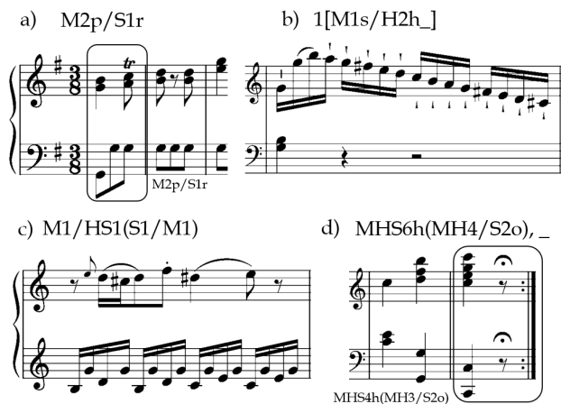
Figure 1. Examples of texture annotations using the syntax defined in [7]. a) K. 283.III m.1-2: the melody is doubled at the third (M2p), and moves in parallel motions (p) over a static layer with repeated notes (S1r); b) K. 279.I m.35: in addition to a melodic layer with scale motive (M1s), a short (sparse, ‘_’) homorhythmic layer appears, without affecting the vertical global density whose value remains 1 on the overall measure (1[ . . . ]); c) K. 279.I m.6: a typical example of Alberti bass, described as HS1 harmonic and static layer of density equal to one, and a possible division into two sublayers; d) K. 279.III m.157-158: a concluding formula with melodic (horizontal movements), harmonic (verticality) and static (regularity and emphasis), high vertical density, with an octave motion (o) optionally detailed in the sublayer decomposition. A comma separates the dense texture from the contrasting silence (‘_’) in the last measure.

been the subject of consequent corpus annotations, due to the variety of musical features it involves and the rarity of formal specification.