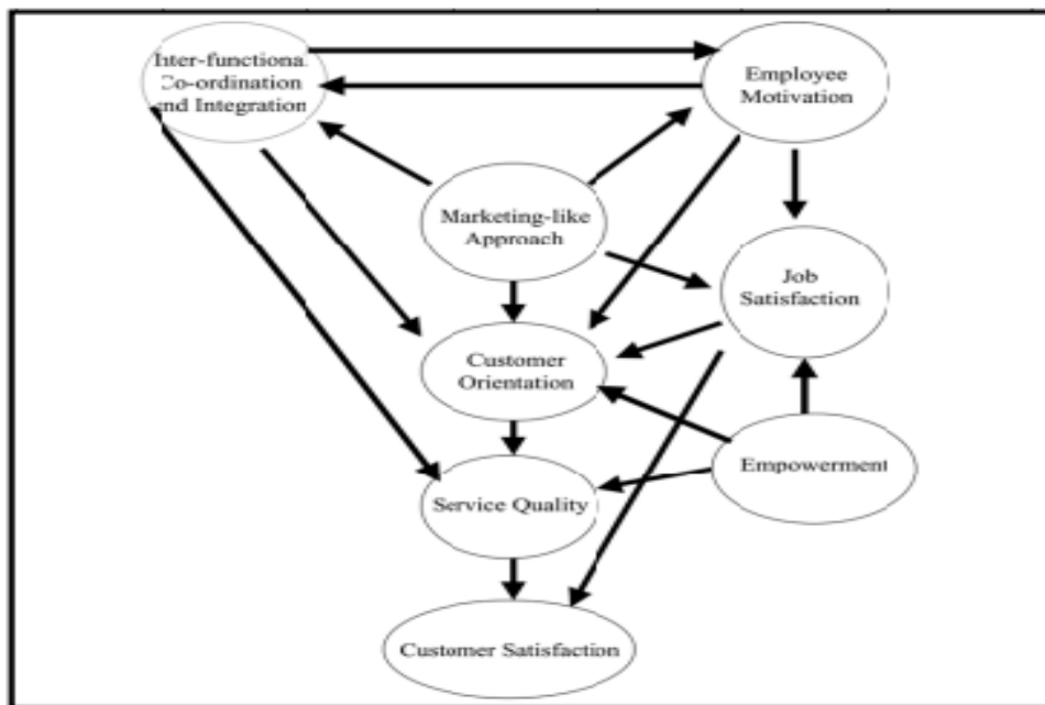
Fig. 1: Internal Marketing

Based on these, they defined Internal Marketing as “a planned effort to overcome organizational resistance to change and to align, motivate and integrate employees towards the effective implementation of corporate and functional strategies” (Rafid & Ahmed, 2000). Farzad (2008) states that applying a marketing-like approach and techniques has a multi-stage model that can be used internally in the organization. It is also believed that stages one, two, and three make the internal marketing research. First is the ability to define realistic opportunities with the current and future competencies and capabilities. Second, is the process of internal segmentation of the participants in terms of characteristics and motivation. Lastly, implementing its barriers from the consistent and positive internal frame in the process of internal marketing mix elements.